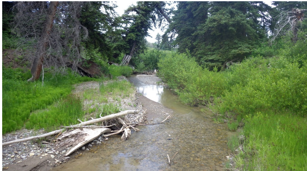
Figure 1: Milk Creek on the White River National Forest (7/1/2015). Flow resistance is due to roughness from bed material (gravel dominated), streambank variability and vegetation, riffle-pool bedforms, large instream wood, and sinuosity.

where V is in ft/s and R is in ft. Manning's n is typically preferred by practitioners while f is most often preferred by researchers. Either can be used for estimating mean channel velocity or flow resistance (friction slope).